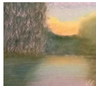
Pastel Painting with Greg Maichack

Clutter Control Workshop Dream Interpretation Workshop Laughter Yoga Weekly Knitting Group Meetings