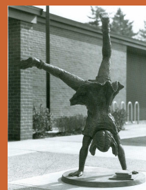
Bellingham Public Library Board of Trustees

The Board of Trustees generally meets on the 2nd Thursday of the month at 7 pm. All are welcome to attend.