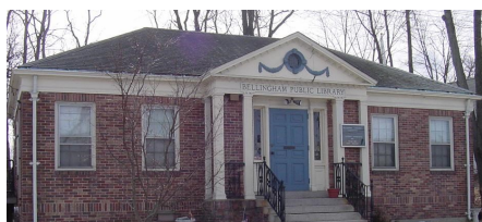
Home of the Ernest A. Taft Jr. Historical Museum

www.facebook.com/ BellinghamHistoricalCommissionMA/