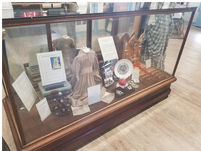
Entry Display Case

On the bookcases to the left and right of the entry inside the door is a short narrative history of Bellingham, by century, starting in the 1600s and ending in 2019, Bellingham’s Tricentennial Year!