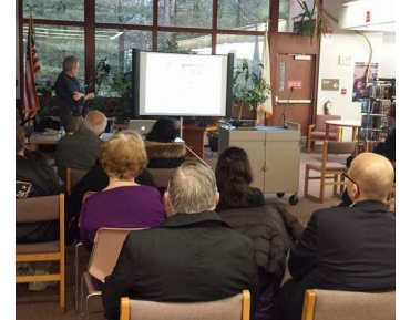
Open House for Seismology & Science Programming

(Science, Technology, Engineering & Math) Programming