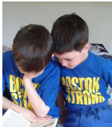
Brothers participating in the library's Read-A-Thon in their "Boston Strong" T-shirts on Marathon Monday of school vacation week.