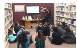
8th Grade Bellingham Memorial Middle School Earth Science Class on Earthquakes and Seismology, held at the library!

This year was the first year that the library and Bellingham's middle school collaborated with the Weston Observatory to bring an educational seismologist to the library to teach the seismology portion of the curriculum.