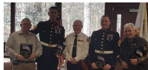
Veterans Honored at the Town's Annual Veterans Day Ceremony | hosted at the library each year