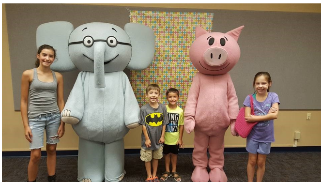
Elephant & Piggie Party!

In addition, during the summer we hosted a variety of programs for children and families of all ages, including: A Fancy Nancy Party, an Elephant & Piggie Party, Touch a Truck, Giant Candyland, A Stuffed Animal Vet Checkup, Spoon Man, and a Battle of the Books completion.