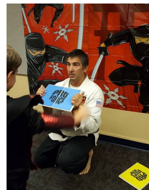
Ninja Practice at the Ninja Party!

These 89 programs were attended by 624 people.