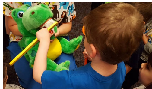
A toothbrushing lesson at Dental Health Story Time