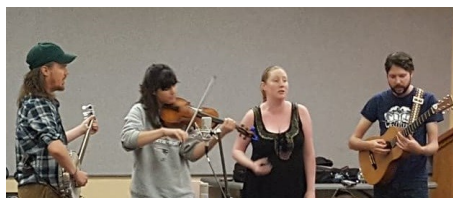
Walking Tour Concert