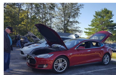
Electric Car Show