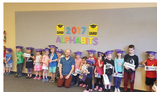
Alphabits 2017 Graduation

These 306 programs were attended by 11,462 people.