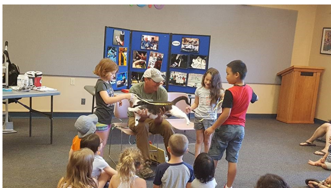
Toto the Tornado Kitten, star of her own book, meets the kids of Bellingham