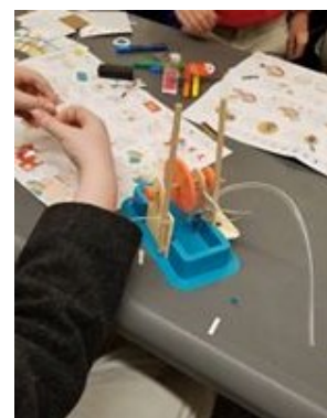
Tinker & Kiwi Crate STEM Programs for Kids

194 Programs for Elementary and Middle Schoolers were attended by 2,444 children.