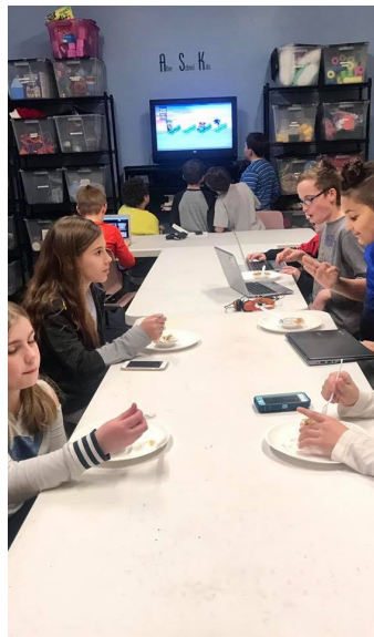
Crafts, snacks and homework in the ASK Program