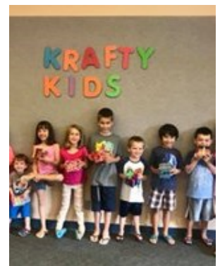
Krafty Kids with their Krafty Projects!

95 programs for elementary schoolers were attended by 921 children.