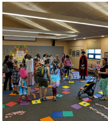
Giant Candyland is always a bit hit!