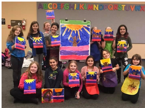
The ASK Kids show off their Sip ‘n Paint creations!

This program was attended by an average of sixteen 4th - 7th graders each day in 2018; up from the 12 per day average of last year!