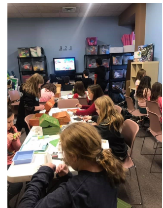
Figuring out the STEM Tinker Crates!