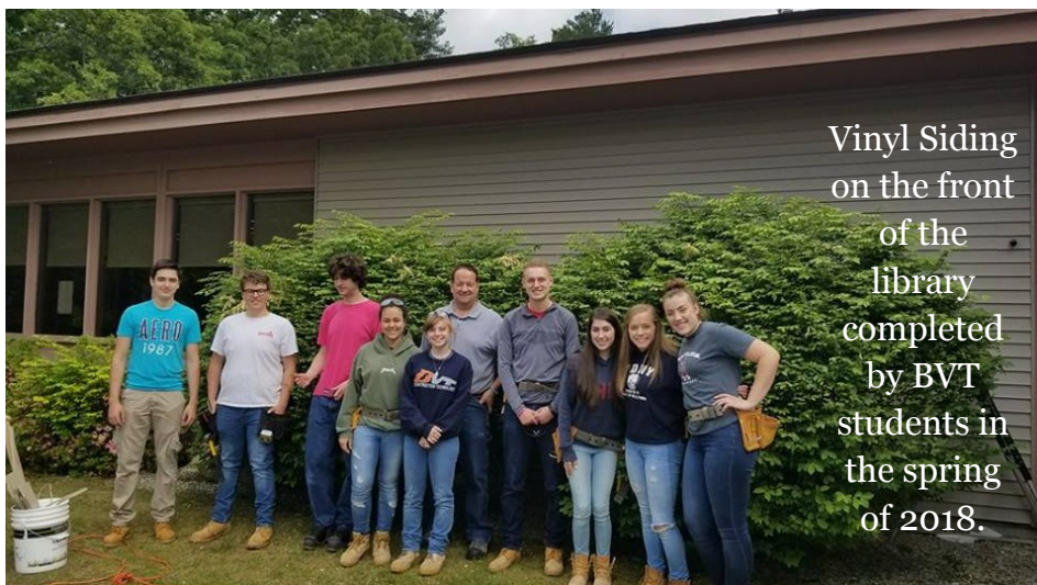
Vinyl Siding on the front of the library completed by BVT students in the spring of 2018.