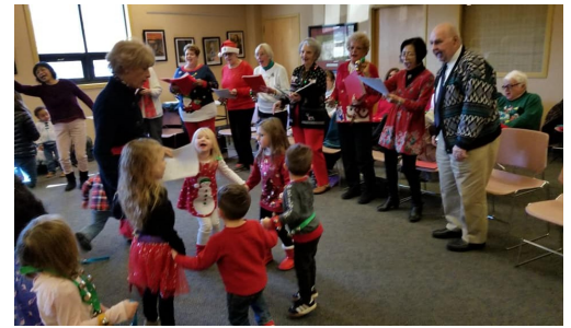
Bellingham Community Concert Chorus Holiday Sing-a-Long

These 539 programs were attended by 17,626 people.