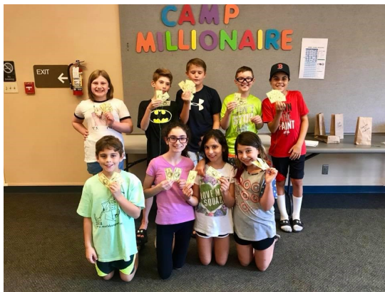
One of our two Camp Millionaire classes showing off their hard-earned money!

We ran two very successful camps in the summer of 2018 and the grant enabled us to purchase the program so we can continue to offer it in the future.