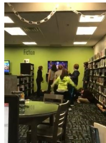
Friday Fun in the Teen Room!

Between 350 and 650 teens visited the room each month during the 2018 school year!