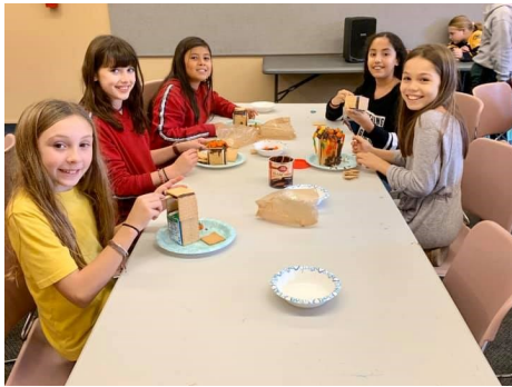
Creating Edible Haunted Houses!

The room is equipped with 10 Chromebooks, a WiiU Gaming Station, DVD player, as well as a wonderful supply of games and craft materials for the children’s use in the after school hours.