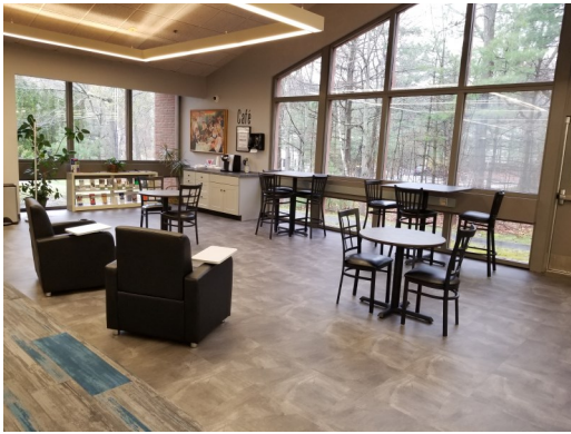
New Café Space Opened