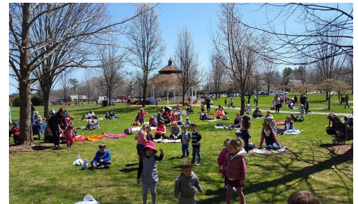
From April through October Picnic Stories is held on the Town Common on Wednesdays at 12:30 pm

These 589 programs were attended by 18,121 people.