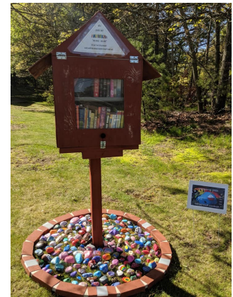
The ASK kids painted many, many rocks to fill the Library’s 300th Anniversary Kindness Rock Garden