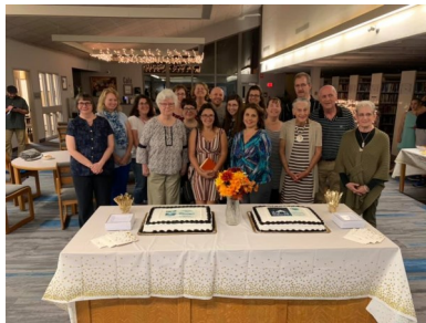
Current and Former Library Staff at the Anniversary Celebration

In September the library celebrated its own anniversaries, 125 years of library service to the town, and 30 years at the Blackstone Street location. All former library trustees, directors and staff were invited to this celebration. The event was paired with a Photography Show & Concert that featured photographs taken in Bellingham.