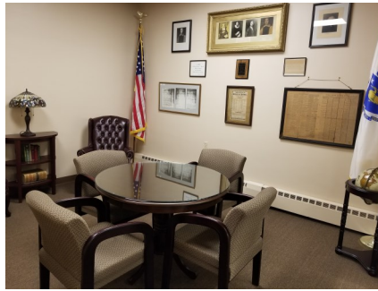
Renovated History Room Funded by the Friends of the Library & the Middlesex Bank Charitable Foundation