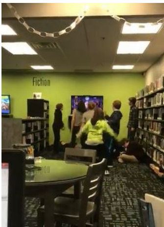
After School Fun in the Teen Room