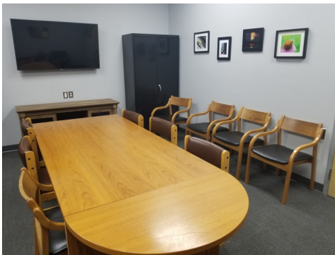
Renovated Conference Room