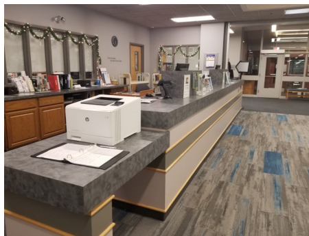
Updated Service Desks & Main Area Carpeting

As mentioned in the introduction, in 2019 we renovated the main area of the library, added a Café, updated the Meeting Room to a Conference Room, and renovated the History Room. Photos of the renovated spaces are above.