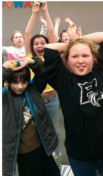
Fun in the After School Kids Program