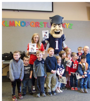
Visit from the New England Patriots Mascot, Pat Patriot!