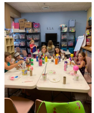
Make Your Own Planet Program!

140 Elementary and Family programs were attended by 3938 people.